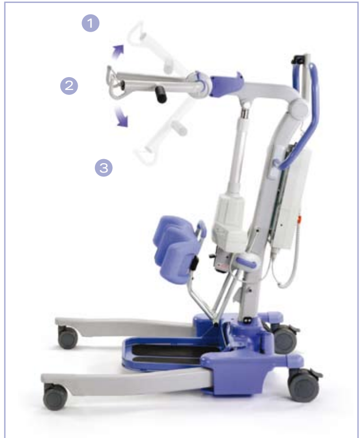
The Journey's three optional cow-horn positions.

With three different cow-horn height options, the Journey can support a wider range of patient heights and sizes. This additional method of adjustment ensures total flexibility for the care-giver.